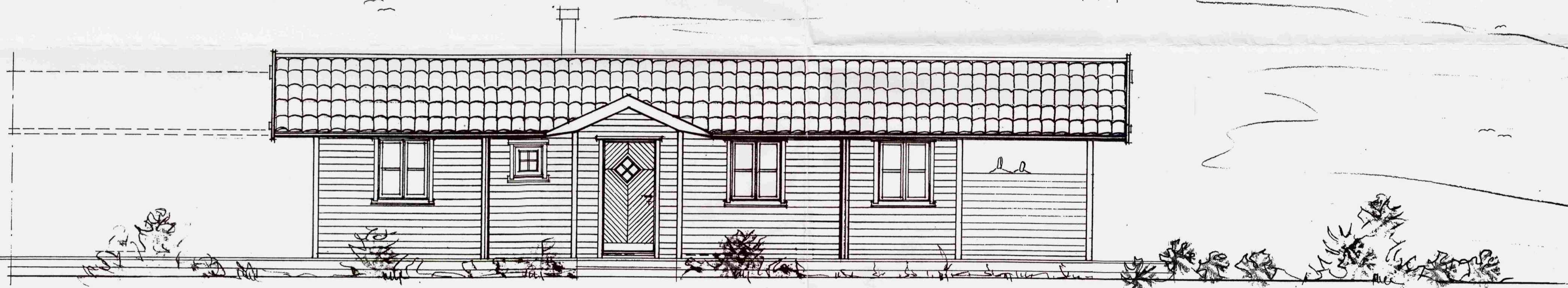
NORÐ - AUSTUR